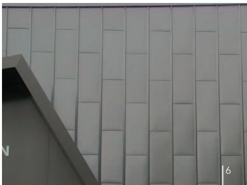
1 Old Government House Brisbane