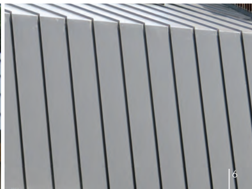
1 Private Residence South Australia