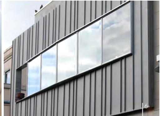
1 Private Residence South Australia